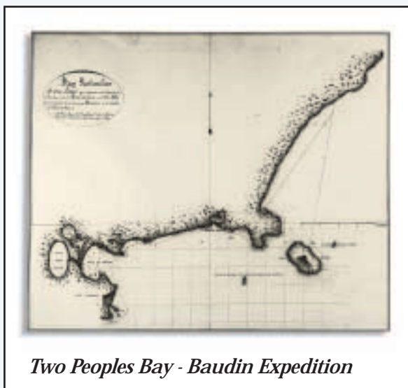
Two Peoples Bay - Baudin Expedition